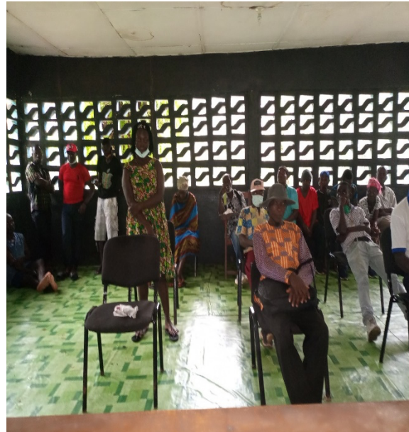
Pictorials of Stakeholders engagement with community residence in the SEZ at Bleewenin Town, electrical District # 3, Grand Bassa County.