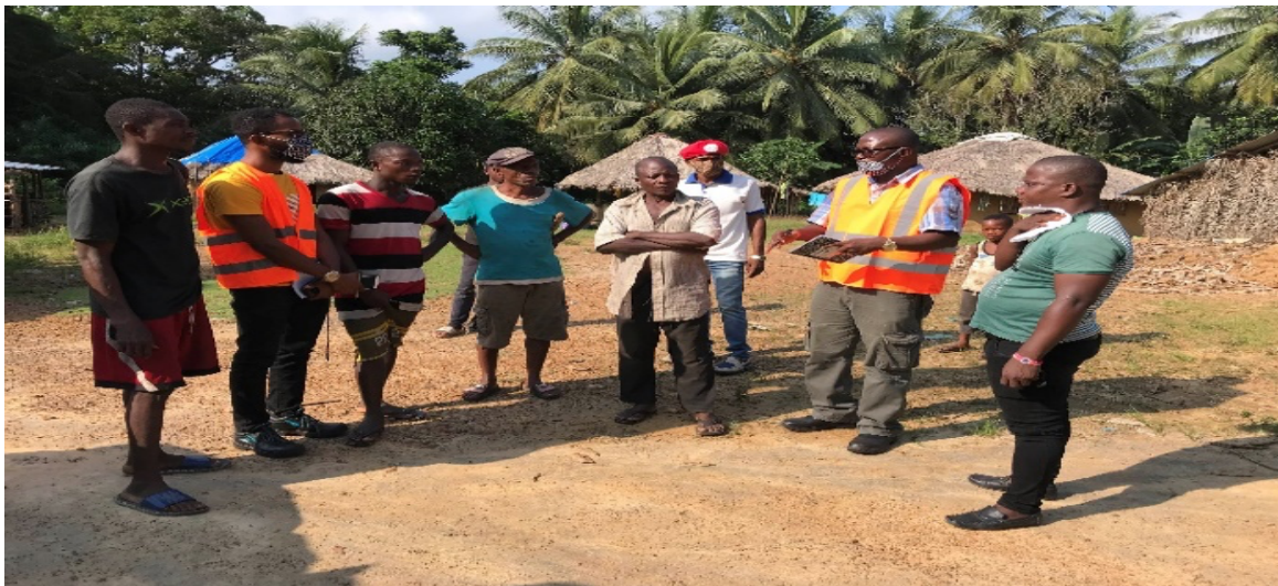
Residence of Kono's Town, one of the community to be impacted in the SEZ.