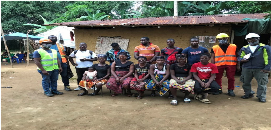
Residence of Doewheo Town, one of the community to be impacted in the SEZ met with our team